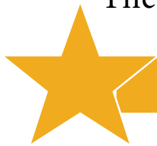
The Axcend Focus LC ®